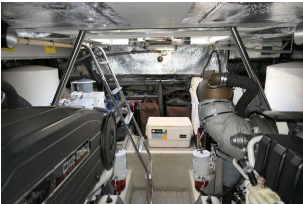
Aft machinery space, generator to port, air-con to stbd, air extractors above turbos, checker-plate throughout standing areas.

Note – These figures are taken from Volvo tests and are intended as a guide only.