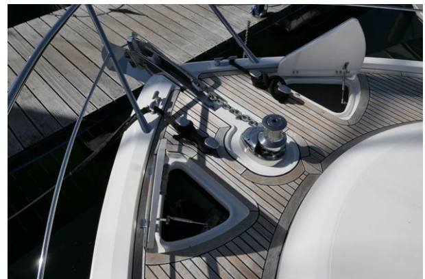
Foredeck with elec. windlass, remote, twin lockers, teak decks.