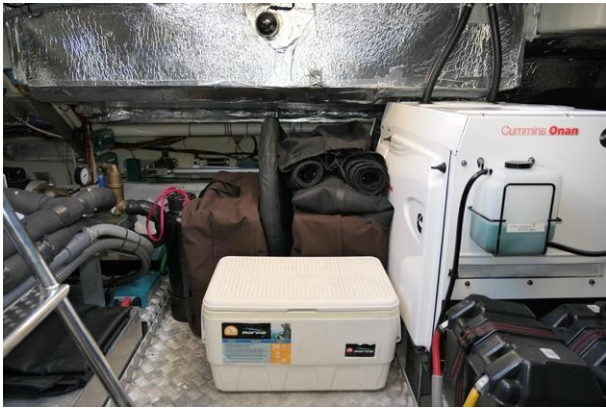
13.5kW upgrade generator.