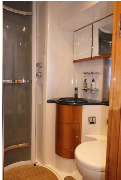
Day heads has a roundel shower with teak grating.