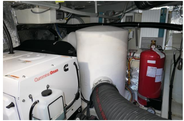
Seafire automatic extinguisher & exhaust mufflers – charger units behind.