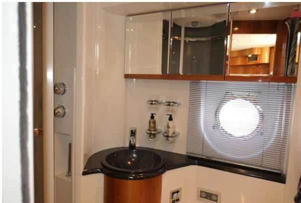
Day heads off starboard guest cabin or saloon, mirrored cabinets, Corian basin, etc. and electric wc.