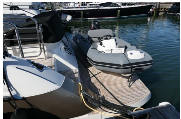
Dinghy not included in sale – letterbox passarelle is to starboard side– very easy aft access.