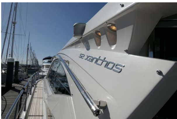
Side lights and decent grab rails running forward along cabin sides.