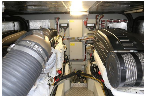
Twin D12-800s, forward engine bay, seacocks front & shafts aft. Very clean and well arranged.