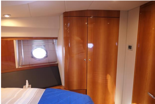
One full-height hanging locker and one shelved unit to access. starboard – access to galley area.

Forward master cabin – drawers beneath berth, beautifully trimmed through, with good light and ventilation.