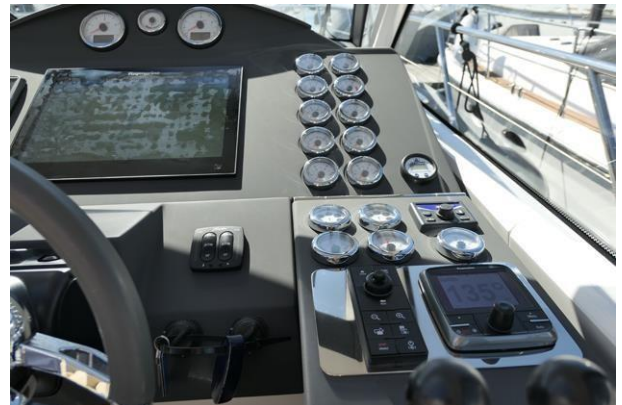
Upgrade Madelena wheel, paired gauges, rudder indicator, all super-clear and ergonomic.