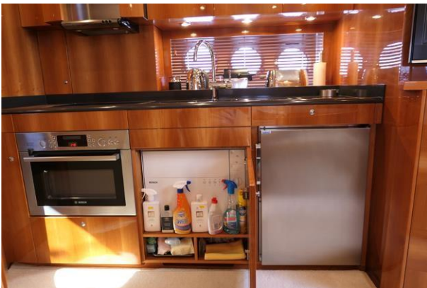
Stainless steel galley appliances, Corian tops and great storage.