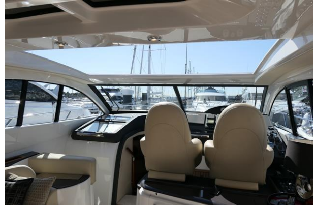
Sun-roof opens to main helm position – also powered side windows, demisters.