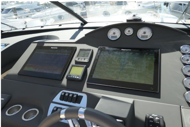
Recent Glass Screens and instruments from Raymarine, Fusion stereo and Nextel anti-glare dash finish.