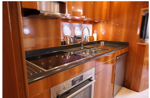
Twin stainless sinks (with Corian cover), all electric cooking, cooker hood, and good light/ventilation.