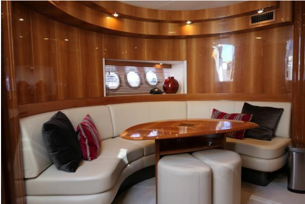
High-gloss table, opening port-lights –with great storage under cabin sole carpeting.