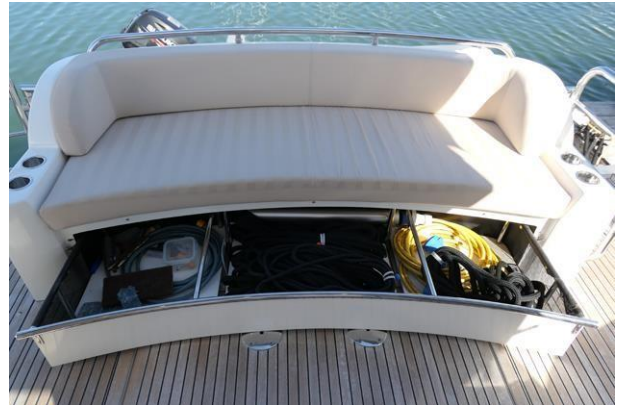
Aft cockpit sofa (with cover), sliding storage locker, cup holders and twin access gates.