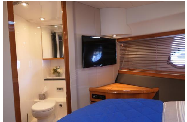
TV to port aft bulkhead and ensuite heads/shower

Overhead deck hatch, trinket lockers port and starboard and blinds to side lights.