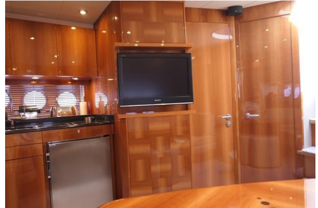
Beautifully finished joinery has really stood the test of time well – Bose surround, TV, etc.