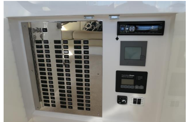
All switching, generator and charger status controls just behind helm seats.