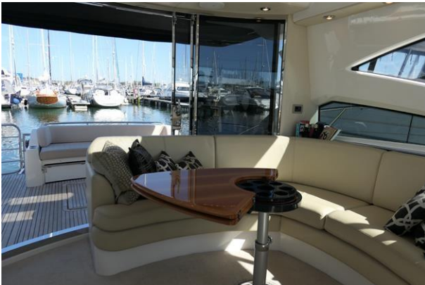
Upper saloon sofa in leather – note panoramic windows, fridge, teak deck and triple section sliding aft stainless steel