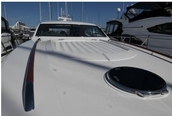
Foredeck with drinks holders, teak decks, varnished grab rails set it all off.