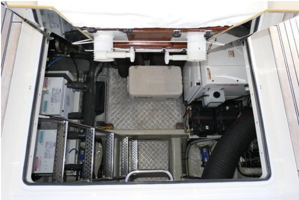
Locking aft access hatch to machinery space, note table fixings and Onan 13.5kVa generator.