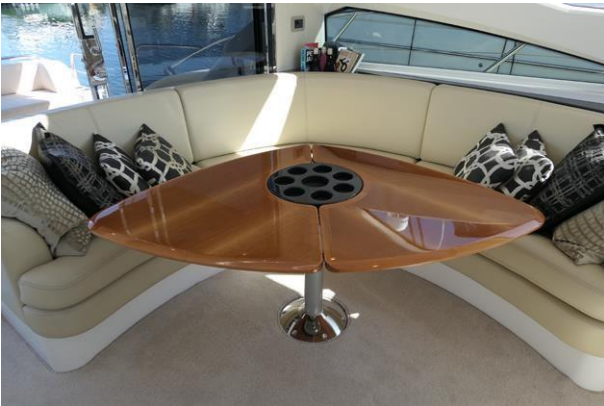
Table detail – very near perfect.