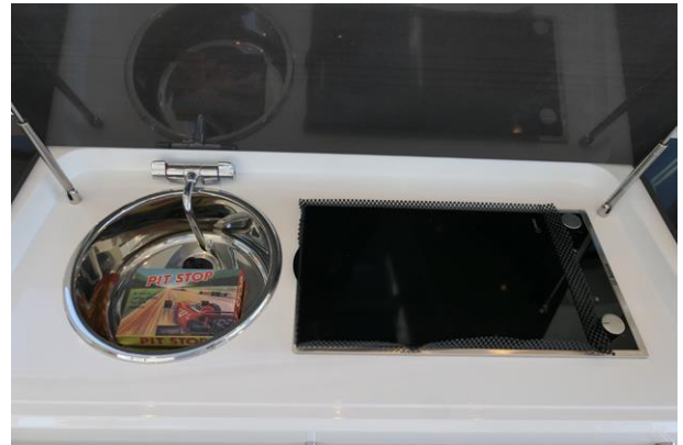
Upper saloon galley with BBQ, sink and cockpit Corian top – plenty of storage beneath. doors.