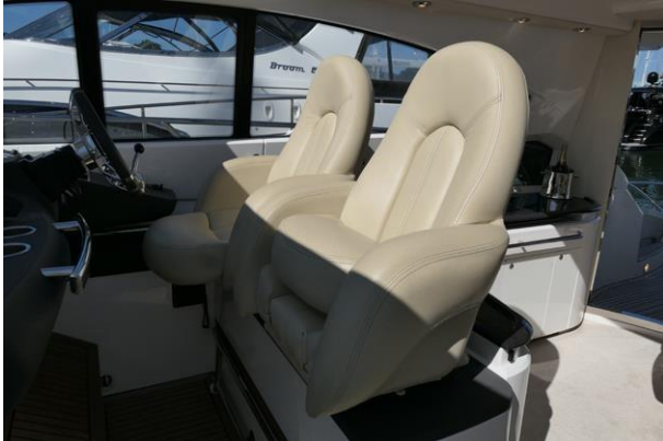
Main helm with sun-roof closed, bolstered seats, Nextel anti-glare dash finish and rolling floor step.